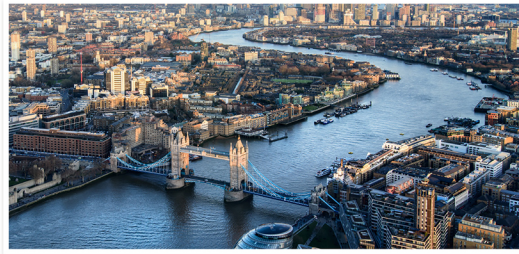
City of London

A city is a large urban settlement where lots of people live and work. There are many shops, restaurants, museums and theatres.