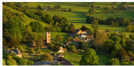
Village of Corton Denham, Somerset

The countryside is a rural area outside of a town or city. Less people live and work in the countryside than in a city.