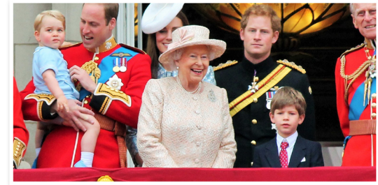
HM Queen Elizabeth II

Queen Elizabeth II is the current monarch of the United Kingdom. She was born in 1926 and became queen in 1952. The Queen is famous across the world.