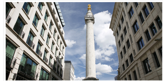
Monument to the Great Fire of London

The Great Fire of London was a significant event in London's history. It began in a bakery on Pudding Lane on Sunday 2nd September 1666. Many buildings were destroyed, including St Paul's Cathedral. Today, a monument stands near the place where the fire began.