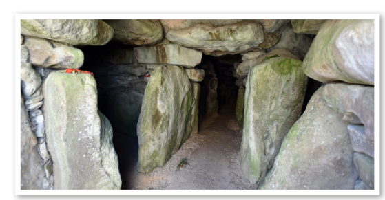
West Kennet Long Barrow, Wiltshire

In the Neolithic period, dead people were buried in graves, or burial mounds called long barrows. These were made of earth, with wood or stone. Bronze Age burials used small, round mounds of earth called round barrows. Sometimes, treasures such as beads, weapons or jewellery were buried with the dead, showing their position in society. Later in the Bronze Age, people stopped burying their dead and cremated bodies instead, putting the ashes in special pots called urns, which were then placed in burial mounds.