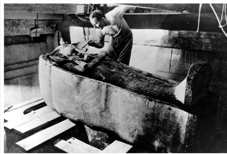
Howard Carter examining the tomb of Tutankhamun

A wealthy Englishman, Lord Carnarvon, was interested in ancient Egypt. He paid for an archaeologist called Howard Carter and a team of workers to carry out excavations in the Valley of the Kings on the west bank of the Nile, where they discovered Tutankhamun's tomb. It took Carter and his team 10 years to remove over 3000 items from the tomb. After the discovery, a series of strange events occurred, including the death of Lord Carnarvon. Many people believed a curse had been placed on Carter's team for disturbing the tomb.