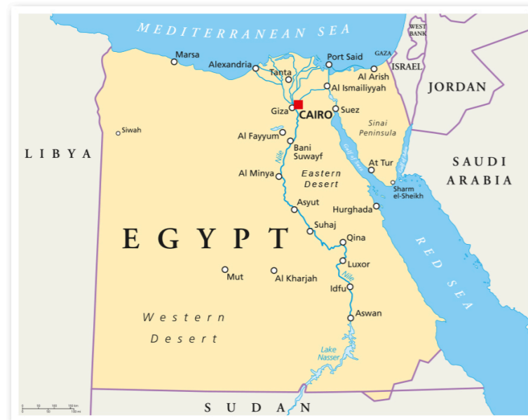
A map of Egypt

Egypt is in the north-east corner of Africa and is well-known for its ancient history and culture. Much of Egypt is covered in desert and there is very little rain. The Nile is the main river that flows through Egypt.