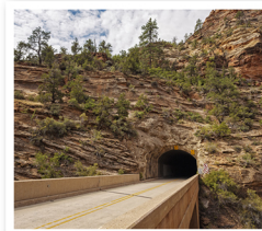
The Zion-Mount Carmel Tunnel in the USA is a tunnel through a mountain.