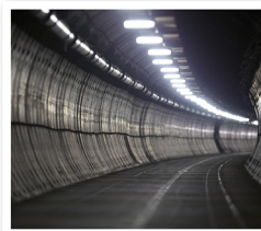
The Channel Tunnel is a tunnel under the sea that links England and France.

A tunnel is a long passage under the ground. Tunnels are usually built as a way of getting from one side of an obstacle to the other.