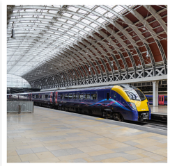
Great Western Railway