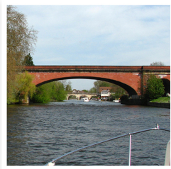
Maidenhead Railway Bridge