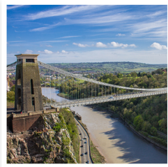
Clifton Suspension Bridge