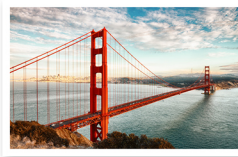
metal suspension bridge

A bridge is a structure built over a road, river or railway that allows people or vehicles to cross from one side to the other. Bridges can be built from a range of materials.