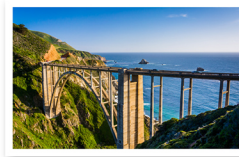
concrete road bridge