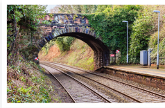
stone railway bridge