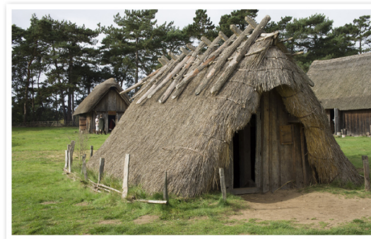
Recreation of an Anglo-Saxon house in Suffolk

After the invasion, people in the south and east of England settled into the Anglo-Saxon way of life. The Anglo-Saxons lived in small villages of huts and farmed the land. They were great craftspeople who used metal, wood, clay and precious stones to make weapons, tools, pottery, furniture and jewellery. When the Anglo-Saxons arrived in Britain, they were pagans, which means they believed in different gods. Over time, most Anglo-Saxons converted to Christianity. They spoke Old English, which developed from the language spoken by the Angles, Saxons and Jutes. Few people could read and write.