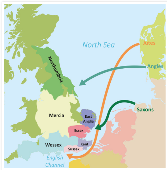
Map showing the different invasions of Britain and the Anglo-Saxon seven kingdom divide

During the Roman rule of Britain, tribes from Denmark and Germany attempted to invade Britain. The Romans built shore forts on the east and south coasts of England to protect themselves from invasion. After the Romans left in AD 410, three tribes called the Angles, Saxons and Jutes invaded England. They attacked and killed Britons or caused them to flee to Cornwall, Wales or Scotland. By AD 600 the invaders had claimed England as their own country and divided it into seven kingdoms. Each kingdom was ruled by an Anglo-Saxon king.