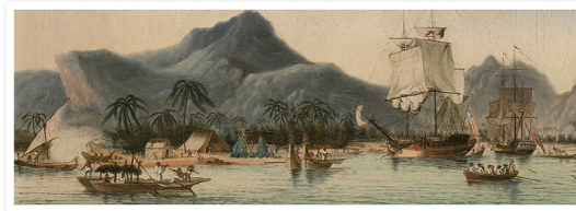
HMS Resolution and HMS Discovery

In 1776, Captain Cook went on his final voyage. He sailed on the HMS Resolution again and the HMS Discovery travelled with him. He was looking for a route between the Atlantic and Pacific Oceans. He visited the Hawaiian Islands, where he was killed.