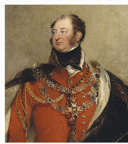
Portrait of Prince Frederick

The Grand Old Duke of York is thought to be about Prince Frederick, Duke of York and Albany, who was the second son of King George III. In 1794, Frederick was asked to lead a huge army against the French. Frederick was not a good leader, and he lost the battle. Frederick decided to learn how to be a better leader. He worked hard, and his army went on to win many battles.